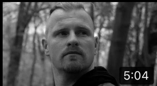
Fort Fortress - music video (26/08/2021)