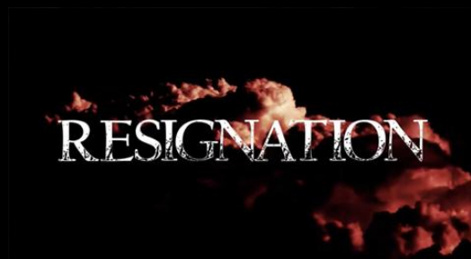
Resignation - lyric video (12/02/2021)

Stylistically, we are inspired by timeless heroes of the Gothenburg school as well as other death and black metal bands. The first EP "Dialogue With The Unconscious" was released on April 23, 2021 and now we are thrilled to release our second EP in Spring 2022. We'll keep you informed!